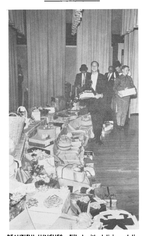
BEAUTIFUL LUNCHES—Filled with delicious delicacies, each colorfully wrapped box lunch reveals the individual artistry of its designer.

The whole evening—beginning to end—proved most successful and profitable.