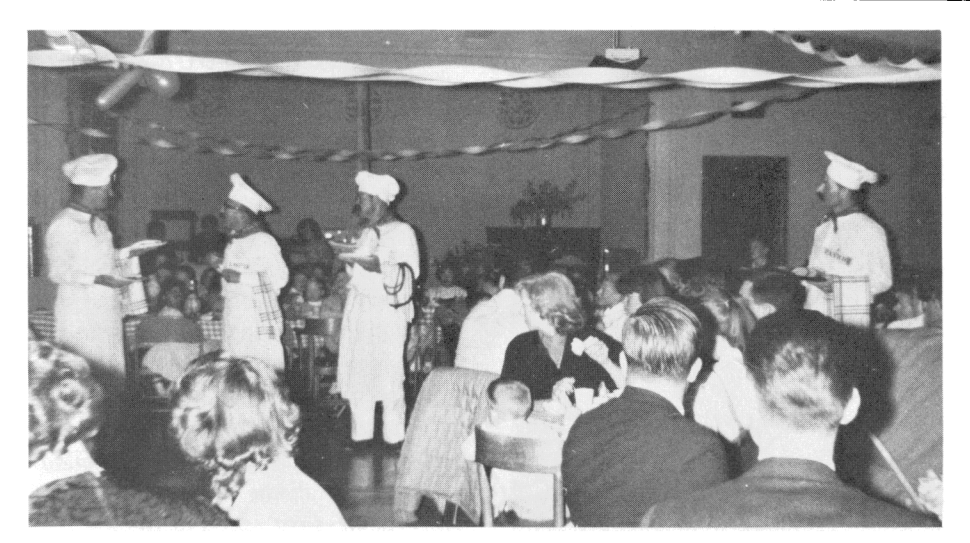
OLD ITALY—Mustached, singing and dancing waiters serve up fun and food delighting San Bernardino members during spaghetti dinner.