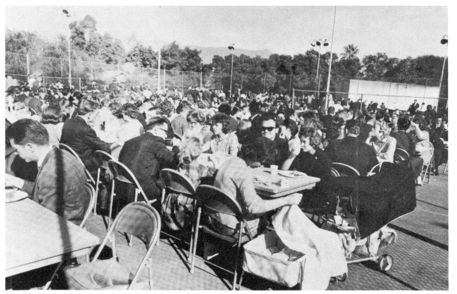
NOON LUNCHEON—Beautiful skies, smog-free air, warm fellowship and good food made one thousand brethren enjoy noon meal at recent Sabbath during Ministers' Conference.

Such a blessing is truly a gigantic step forward in God's Work for the people in Great Britain. We can surely be looking for much more growth in this Work in that area of the world.